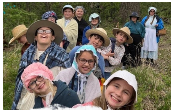
Enarson 4th graders attended the 25th annual Oregon Trail event in May. Dressed in period clothing they hike 3-miles simulating the journey made by the original Oregon Trail settlers. Volunteers present short informational programs at various stops along the way. It is always a favorite field trip.

We received a generous donation from an alumna of $500 to be directed to the Speech and Drama Department. Donations such as these are welcome and much appreciated. Do you have a specific department to which you would like to make a donation? Or perhaps your class would like to donate to a specific need.